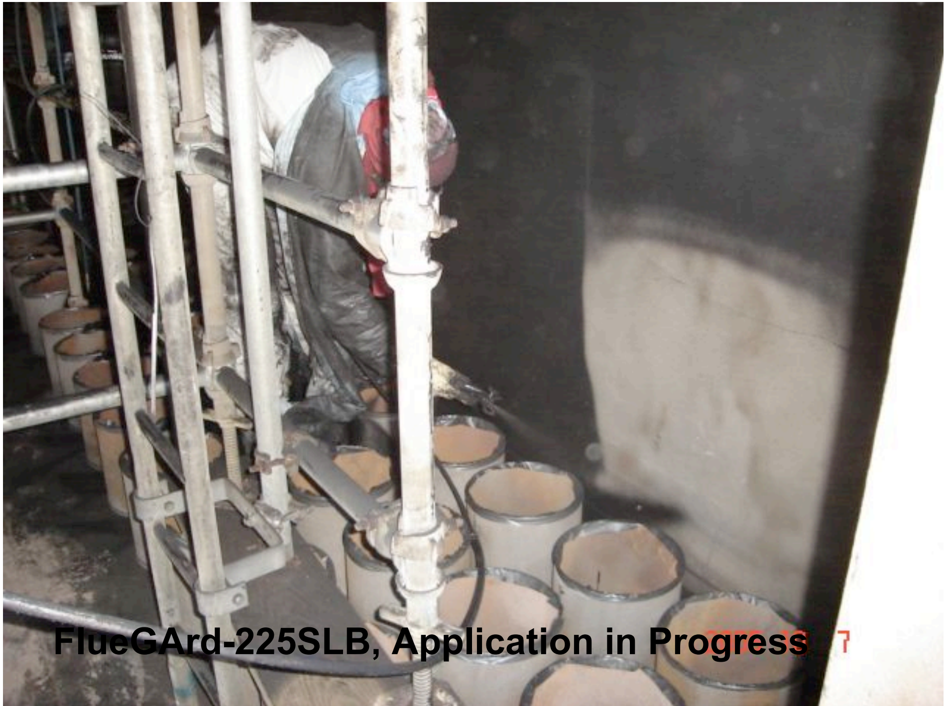
FlueGard-225SLB, Application in Progress 7